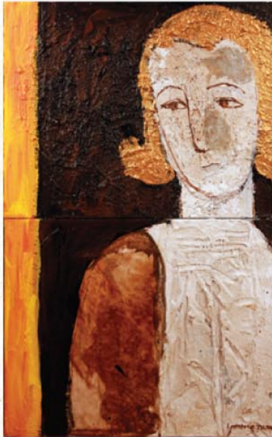
Ordinary Saints B-3 2011 mixed media 20 x 30"

abg andrew bae gallery CONTEMPORARY ASIAN ART